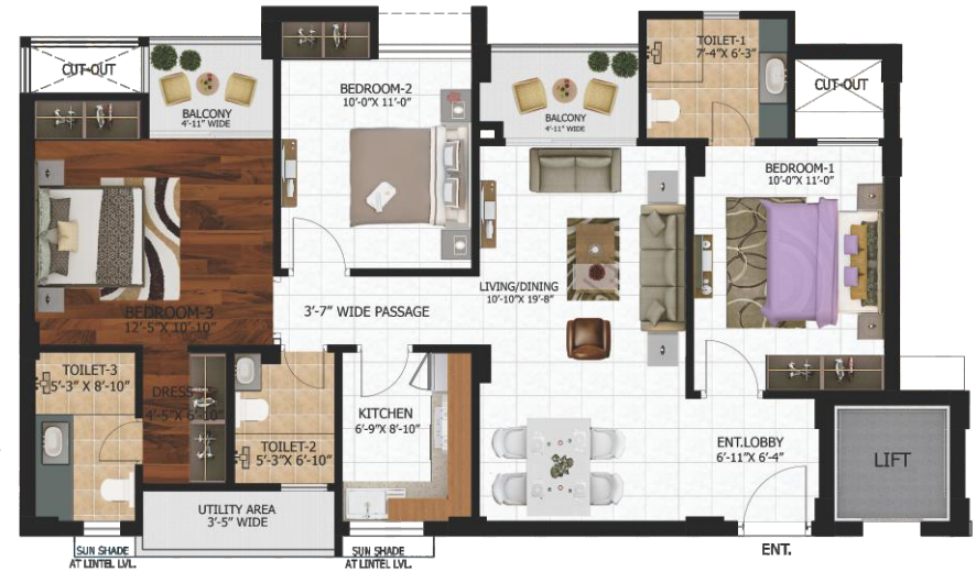
Unit - 04