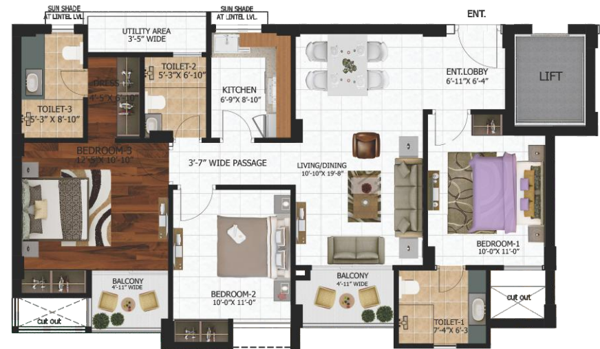
Unit - 04