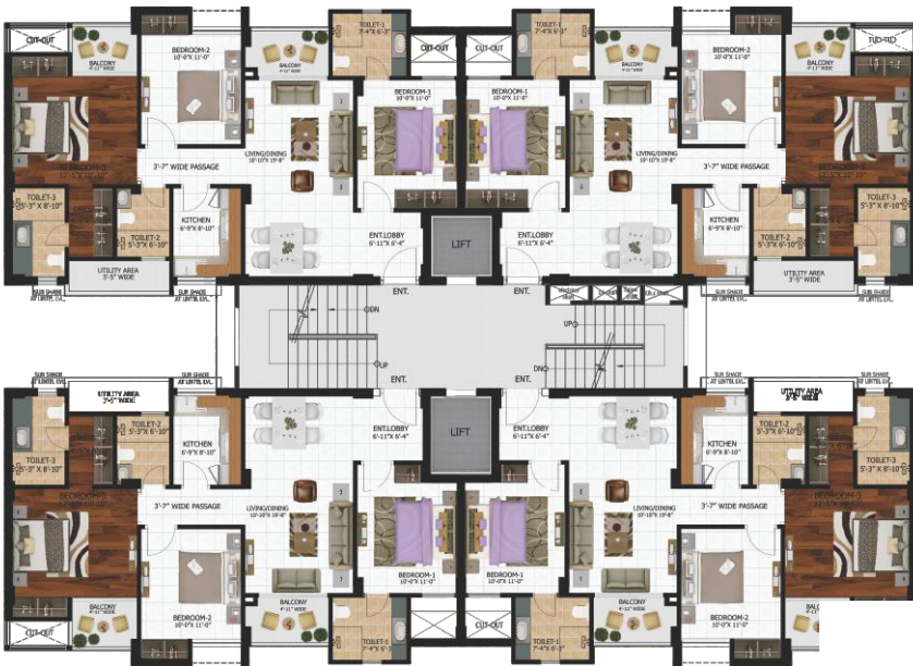
Unit - 01